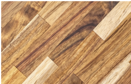
Deeper hues with lighter accents