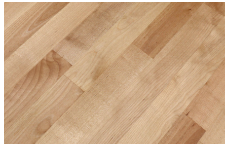
Subtle grain with light color ranges