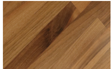
Darker brown with lighter golden tones