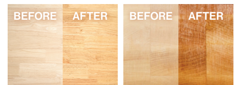
DuraKryl® (urethane-based satin finish),