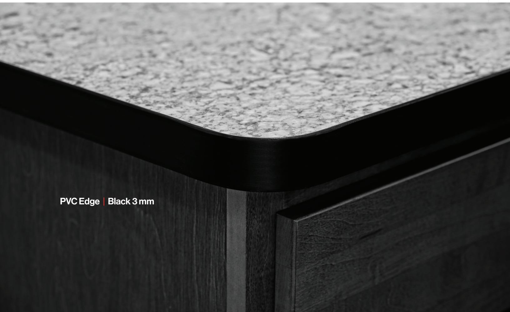
PVC Edge | Black 3 mm