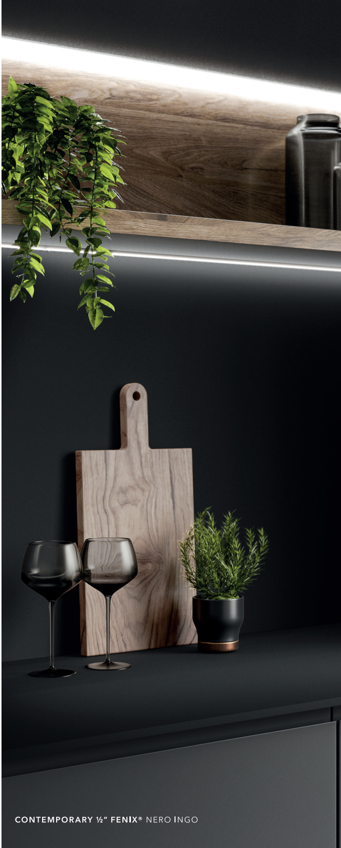
CONTEMPORARY ½" FENIX® NERO INGO

Thermal healing of superficial microscratches