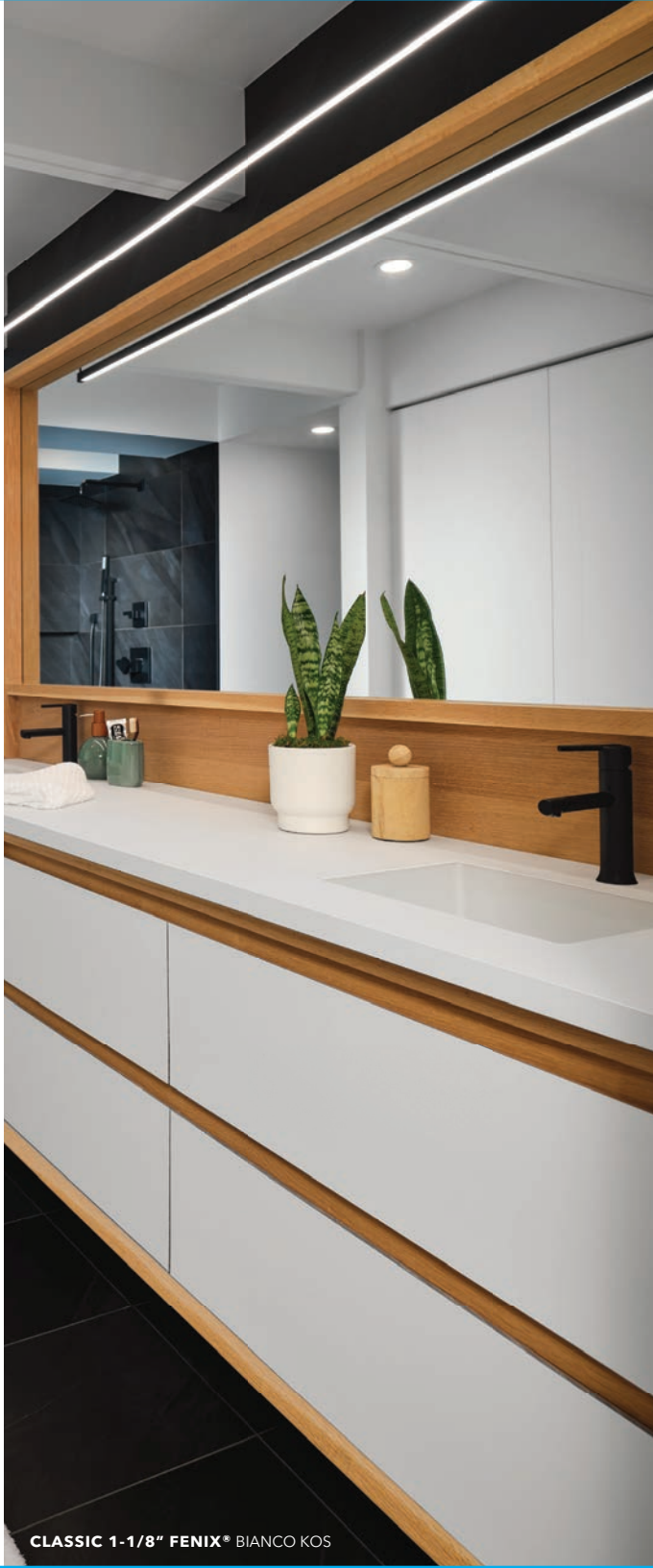
CLASSIC 1-1/8" FENIX® BIANCO KOS

Thermal healing of superficial microscratches