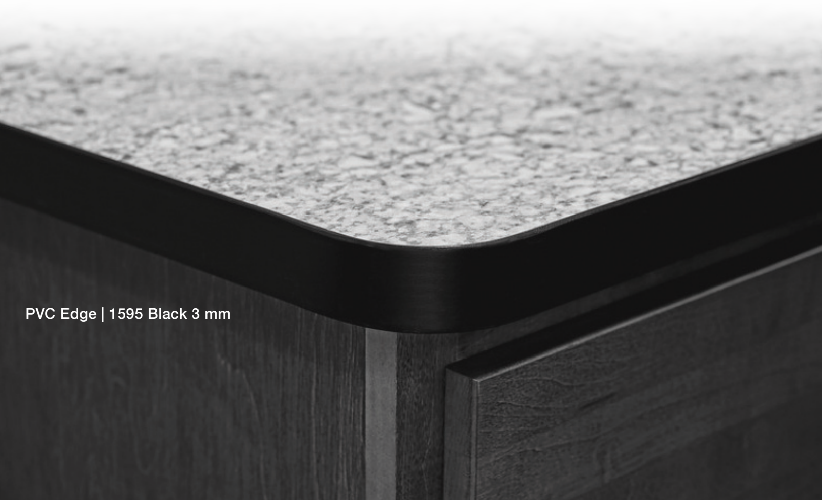
PVC Edge | 1595 Black 3 mm