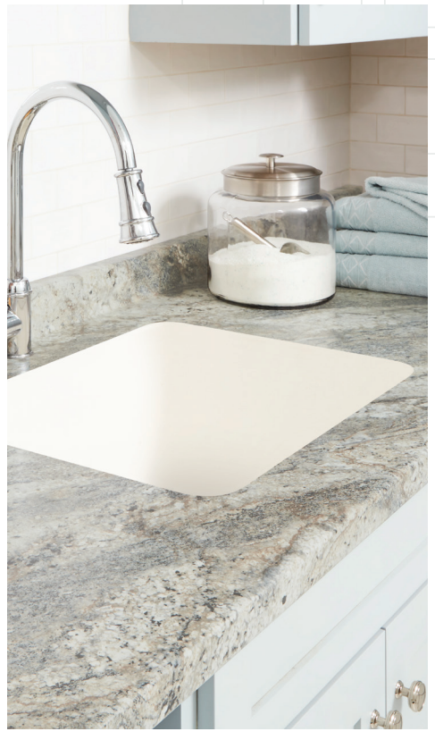
6314-58 Neo Cloud